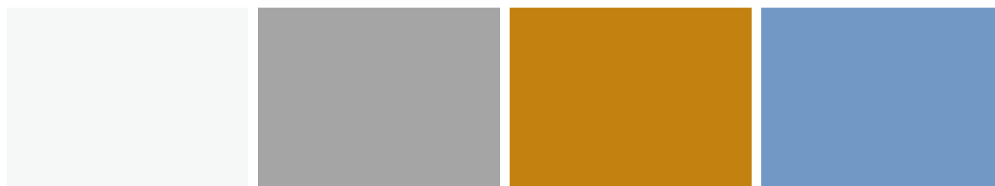
Satin White Pearl Steel Silver Metallic Harvest Gold Metallic Sky Blue Metallic 1